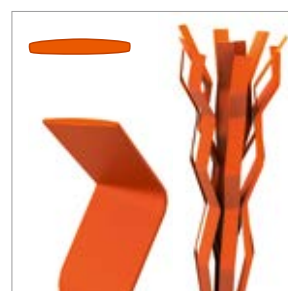
Fibre thickness: approx. 100 µm